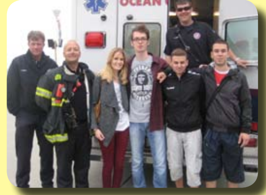
Safety Night with Fire Department, Beach Patrol & Police Department