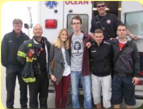
Safety Night with Fire Department, Beach Patrol & Police Department