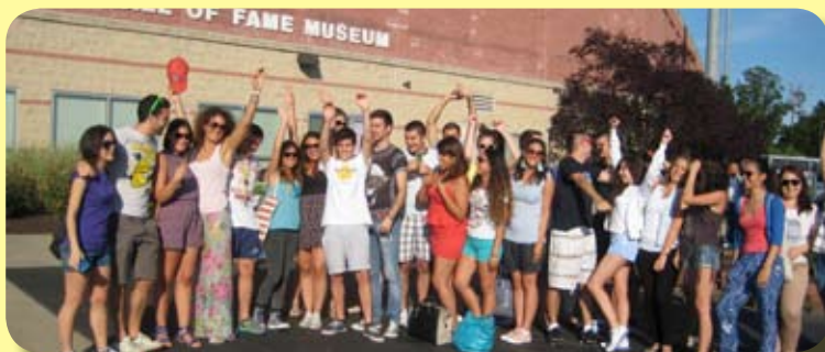
Trip to a Shorebirds game