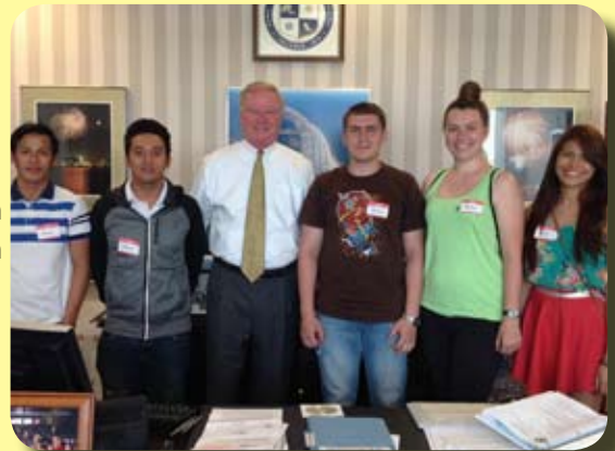
Meet and Greet with Mayor Meehan